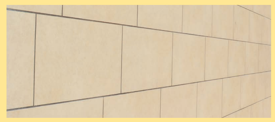
Porcelain tile is resistant to stains and water marks over time.