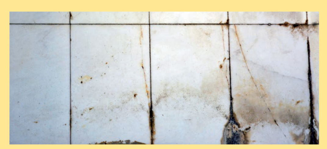
Natural tile can develop stains and water marks over time.

In addition to the 20mm EVO, Nesma Oribt also offers 17mm and 30mm tiles.